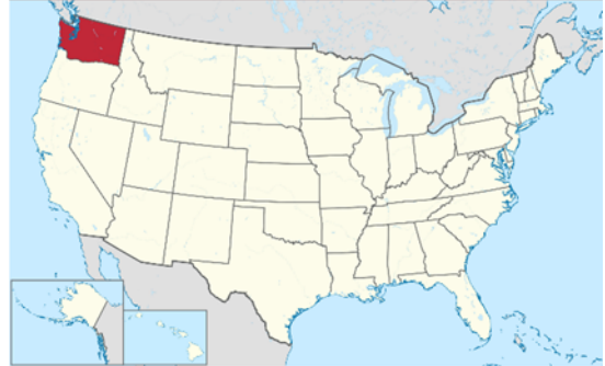
Location of Washington