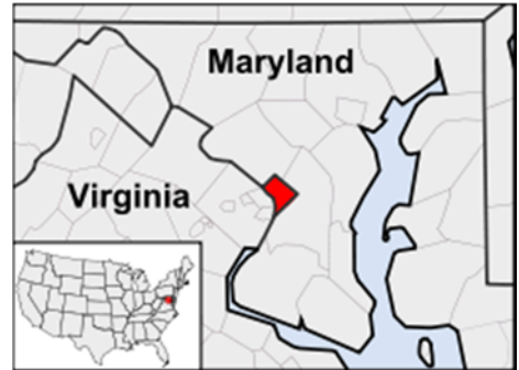
Location of Washington D.C.