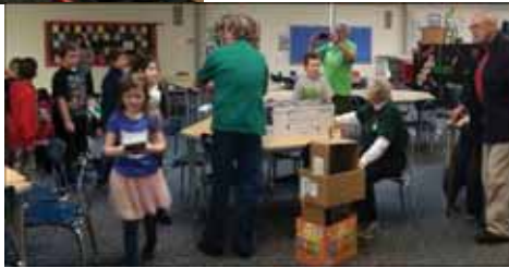
Caras Elementary (top) and Jason Lee Elementary (bottom).