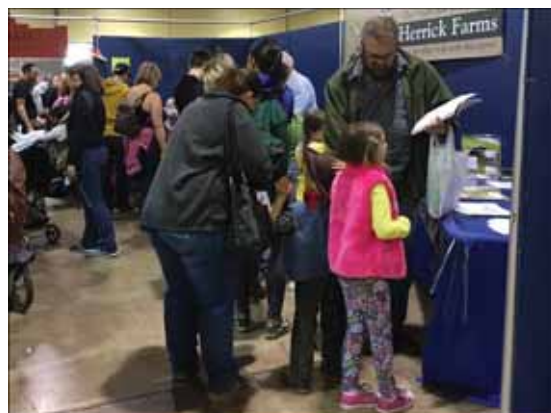
A steady stream of families stopped by the Grange activity center during Ag Fest and many took home information about the Grange.