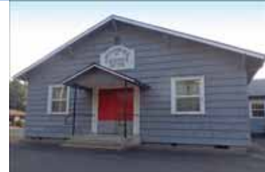
Woodburn Grange #79 Marion County Organized February 1874

Their hall was built in 1897 as a church and purchased in 1929 by the new Grange. The hall is heavily rented.