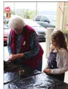
Riversdale Granger helps a young lady pot her plant.

Riversdale Grange #731 in Douglas County, in cooperation with Roseburg Coastal Farm and Ranch, sponsored a Grange Garden Zone event. The event on April 23, 2017, was held in conjunction with National Grange Month. Eight Riversdale members, including Junior 1+ members, assisted children planting plants to take home.