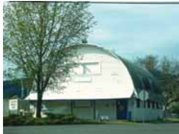
Thurston Grange #853 Lane County Organized 1936

Their GWA has an active sewing group and donates kids' quilts and pajamas; aprons and lap quilts to seniors. They donate money to their local food bank and send totes full of entries to state Grange.