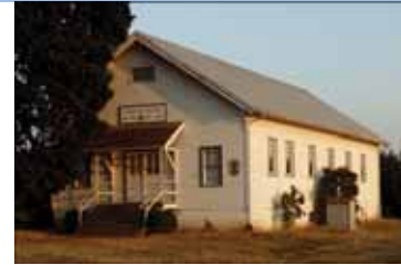
Fairfield Grange #720 Marion County Organized 1929

Location: 201 Division St NE {off S Water}, Silverton Meets: 2 nd Sunday - directly following program community potluck 5:30 pm 6:15 pm Program Mail address: PO Box 1115, Silverton 97381 Contact: Aaron Embree