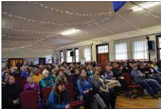
More than 200 people attended community event in preparation for the Big One.

This winter was a good example of why citizens need to be prepared. The Gorge experienced the closure of I-84 several times, causing fuel and food shortages, to name just a couple issues. They also experienced an oil train exploding last summer causing a major traffic crisis in both Oregon and Washington for 24 hours. Some commuters were stuck in their cars in sweltering temperatures for eight hours. Rockford Grange is making plans to be a disaster center for their neighbors in the event of a disaster.