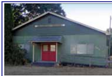
Silverton Grange #748 Marion County Organized 1930

Best known for: Music Jams, getting together for fun. They have a neighborhood garden complete with a moon garden bench and a hitchin' post and water trough. Other activities include Annual Holiday Bazaar and garden parties. Available to rent for special events.