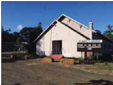
Elmira Grange #523 Lane County Organized 1915

Other Projects: Members volunteer at Coburg Antique Fair, Quilt Show, Circus, Parents Night Out, and Golden Years. In addition the Grange has regular users including a Yoga class, an Exercise class and the Sew n Sew's Quilting.