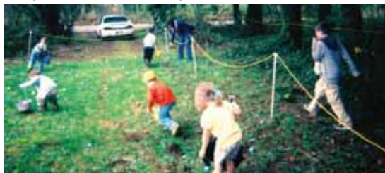
When the whistle blew, off went seventy-seven children.

After the hunt they came into the Grange hall where there was a large