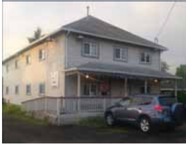
Coburg West Point Community Grange #535 Lane County Organized 1915