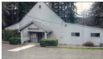
Triangle Grange #533 Lane County Organized 1915

Known for their unique building, they hold a community flea market twice a year, rent their hall and are involved in community service.