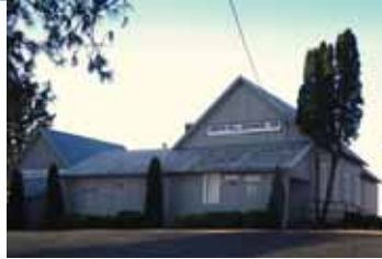
Union Hill Grange #728 Marion County Organized 1929