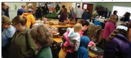
Silverton Grange's annual Seedy Saturday crowd.

Kids got to take home their own planted sunflower seed to care for. The event also kicked off the Grange's opening of their 12-bed community garden to community neighbors seeking a little plot to sow and grow, learn gardening tips and work together for garden aesthetics and productivity using sustainable, water-conserving techniques. Collected canned food and funds at the event were donated to support the city area food pantry.