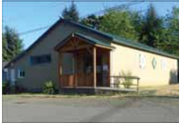
Scotts Mills Grange #938 Marion County Organized 1954