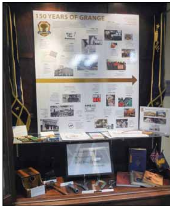
Above: The 150 Years of Grange in the Corvallis-Benton County Library.

We are still scheduling Ontario Community, Sherwood Public, and the Southern Oregon Historical Society Research Library in Medford.