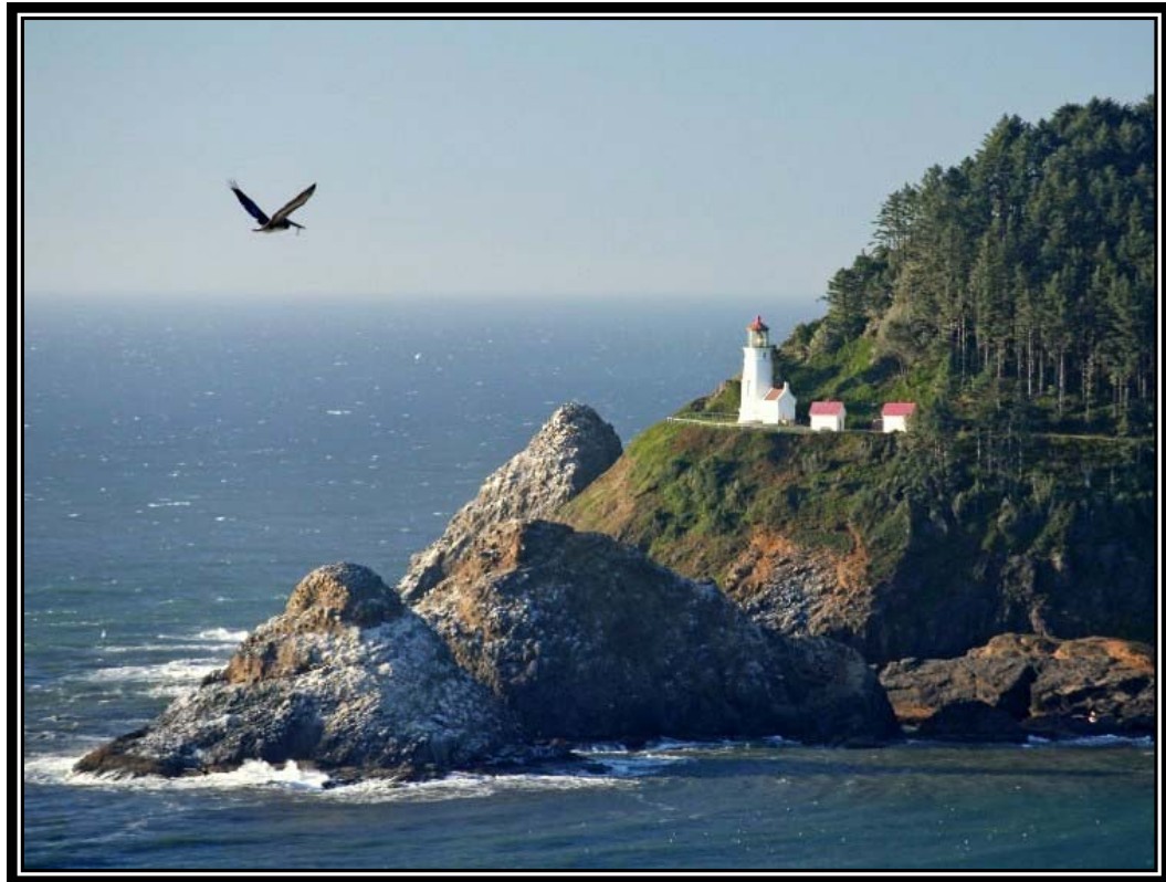
Heceta Head Lighthouse Florence, Oregon

144th Annual Convention Florence, Oregon June 24-29, 2017