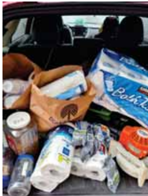
The Sandy Grange donated paper products to the Veteran's Village.