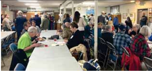
Those in attendance enjoyed nachos in celebration of Cinco de Mayo, beverages, and cookies in the basement before the forum.