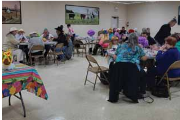
It was a "Cinco de Mayo Fiesta" at Lane Pomona Grange's High Tea.