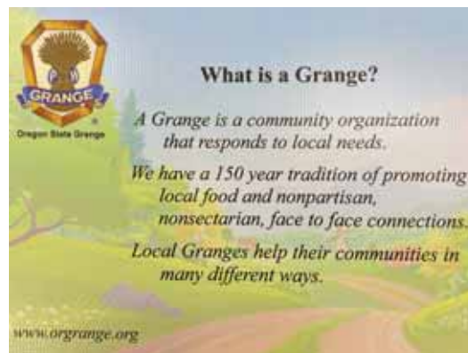
Above: This "What is the Grange" sign is a gift to each Grange. If yours hasn't received it yet, look forward to receiving it in the next few months.