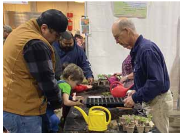
Above and left: Grangers busy helping families plant the tomato and marigold starts in peat pots, ready to take home.