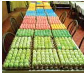
1800 eggs waiting to be hidden.

The Easter Bunny made a visit to the Santiam Valley Grange #828, Linn County, on Easter Sunday, for their annual Easter Egg Hunt, bringing over 1800 hardboiled eggs, and cash prize eggs for each age group. Children age 1 and under also received several stuffed animals. About three hundred people were in attendance. Grange members and community members working together made this a successful event.