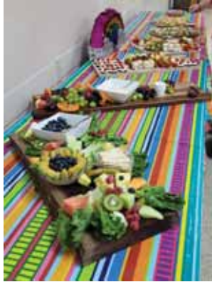
As usual there was no shortage of delicious food.