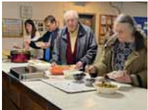
Fix your own nachos were well received.

On Sunday May 5 th Clackamas County Pomona Grange #1, hosted a successful Candidates' Forum at Abernethy Grange for the County Commissioners and Sheriff positions that were on the May ballot. The Forum started with nachos in celebration of Cinco de Mayo, beverages, and cookies in the basement then the action moved upstairs with all candidates given equal time to make a statement. A question-and-answer time then ensued.