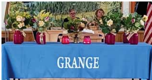
One of the vendors at the Redland Grange Farmers Market made beautiful arrangements for each Grange that had members pass away in the last year.

Seen through the eyes of Faith, we remember our Brothers and Sisters not as ones dead, they have only gone on before us through the gates of the Grange above, where dwells the Great Master of us all.