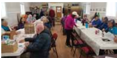
Little Deschutes Grange members looking through the information provided by the State Grange.