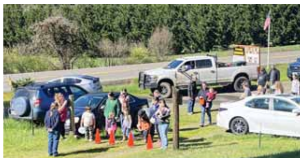
Above: Children lined up ready to find the eggs.