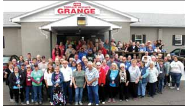
Over 170 Grangers from the western states of California, Nevada, Oregon Washington, Idaho, Montana and Alaska attended the 2024 Western Regional conference.

Saturday Participants again boarded buses on