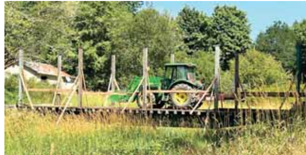
A tractor drives across the completed base and driving surface of the bridge. Posts have started going up to support the roof.

David Wallace, a member of Fern Hill Grange and the guy who has run the speaker system for state Grange convention the last several years, provided the beams for the project. They started with 6"x6" beams on eighteen-inch centers over the whole 53.5-feet, each being fourteen feet long for the base of the decking then 2x10s for the driving surface. Plans are still developing for the walls and roof.