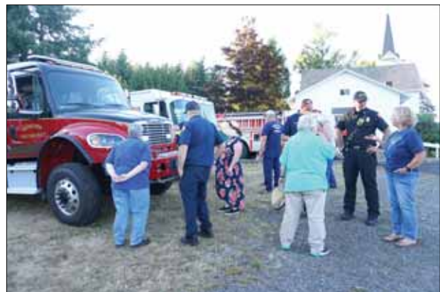
R: Springwater community members checked out the new fire fighting vehicle for wild fire fighting.

The Fire Department brought out their new, not yet in-service, four-wheel drive brush rig and the sheriff's department brought out one of their "yachts" better known as a rescue boat. The Grange provided strawberries and ice cream for all in attendance.