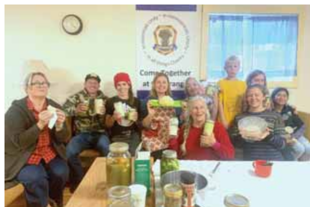
Grange members and community friends show off their products after the first class in South Fork's Grange's "The Generation's Project".