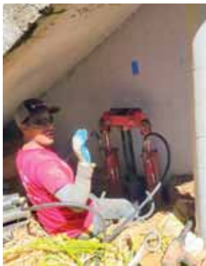
Above: Setting of one of the pilings.

Ram Jack put in twelve pilings on north end of the building. The pilings were attached to the foundation to keep the building from settling any further and sliding down