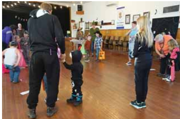
Below: The cake walk proved fun for young and old alike.