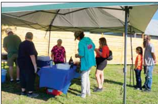
Above: Cider Day attendees wait in line for ice cream

If your Grange is interested in having the GROW Club serve an Ice Cream social for one of your events, contact the GROW Club President or plan to come to next year's State Grange convention in Tillamook and bid on one.