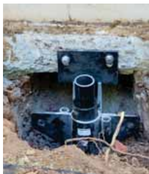
Below: A piling attached to Abernethy Grange's foundation.