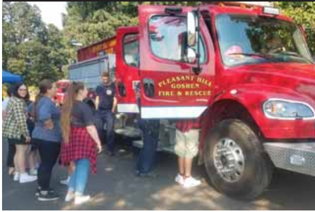
Attendees checked out the Goshen/Pleasant Hill Fire Department and EMT truck.