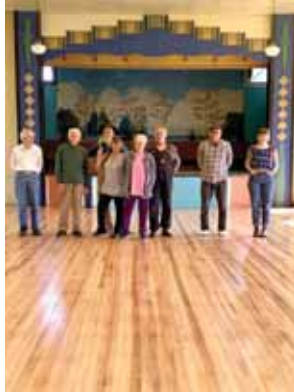
Netel Grange members show off their beautifully refinished floor.

The Grange feels they got the perfect results and should keep the floor in great condition for the next few decades. The polyurethane coating can be reapplied to heavy traffic areas as the years go by.