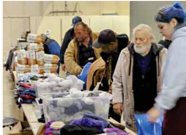
Above: Veterans select from clothing items donate.