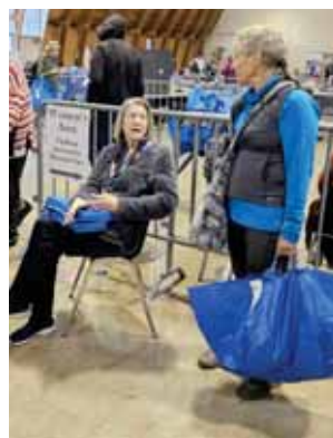
There is a special area with donated items for women veterans at the Stand Down.

Services provided included haircuts, dental work, massages, employment counseling, referrals to local social service providers, and assistance with accessing veterans benefits. Attendees were served breakfast and lunch, and were honored for their military service during a special program.