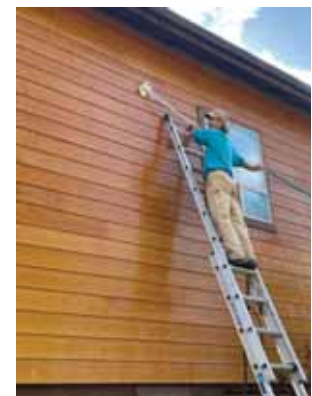
Above: Volunteers washed the siding of the Grange hall.

Now, who is going to volunteer to come clean up all the bat guano?