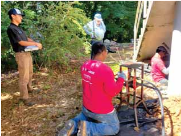
Above: Members of the Ram Jack crew working on Abernethy Grange hall.