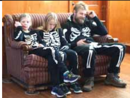
L: A skeleton family taking a break from the activities at Springwater's Halloween party.