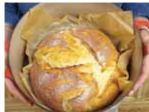
L: A class participant shows off a finished loaf of sourdough bread.