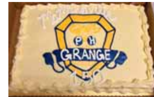
Above: Those attending enjoyed this beautiful cake.