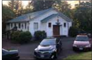
Abernethy #346 Clackamas County Organized 1904

Meet the District #4 Granges that are our hosts for the 2025 Oregon State Convention.