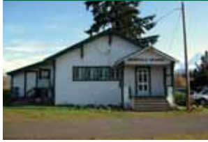
Parkdale #500 Hood River County Organized 1913

Location: 7375 Clear Creek Rd, Parkdale Meets: 1st Mon 6:30 pm; Pot- luck 3rd Monday 6:30 pm