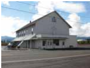
Pine Grove #356 Hood River County Organized 1905

Other projects: making berry pies- a lot!