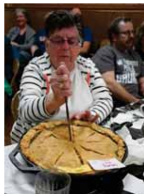
The apple pie in a 12" cast iron pan which went for $210.

Top selling pie for the evening was an Apple pie in a 12" cast iron pan