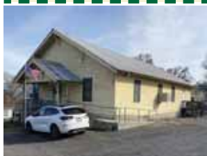
Cherry Park #667 Wasco County Organized 181925 (Re-org 2004)

Location: 1002 Lambert Rd, The Dalles Meets: 2nd Sun 1pm - contact to confirm