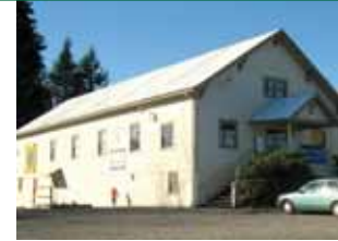
Boring-Damascus #260 Clackamas County Organized 1893

Location: 27861 SE Grange St, Boring Meets: 3rd Tues 7 pm; potluck 6 pm Mar, Jun, Sept, & Dec