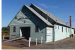
Maplewood #662 Clackamas County Organized 1925

Location: 25480 S Hwy 99E, Aurora Meets: 4th Sun 4:30 pm; potluck 3:30 pm