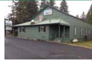
Barlow Gate #157 Wasco County Re-Organized 1928

Location: 56960 Market Rd, Wamic Valley Meets: 1st Thurs 6:30 pm