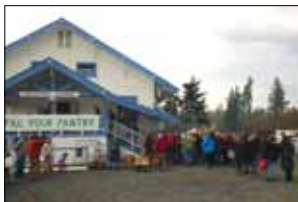
Rockford #501 Hood River County Organized 1913

Uniqueness: Pine Grove Grange shares like-name with Pine Grove Granges in New Hamp- shire and Washington State.