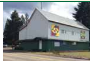
Clarkes #261 Clackamas County Organized 1893 (Re-org 1926)

Best known for: quilting: hosts the oldest hand quilt club in USA dedicating quilts to veterans, Ronald McDonald House, Dornbecher Hospital, fire departments, The majority of the Grange members are quilters. Other projects: repainting Hall's exterior of the Grange building.