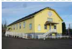
Sunnyside #842 Clackamas County Organized 1936

Location: 13130 SE Sunnyside Rd, Clackamas Meets: 2nd Thurs 7:30 pm; potluck 6:30 pm