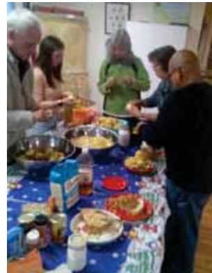
South Fork Grange recently held a couple of Generations Project classes. Left: are students learning about pie making.