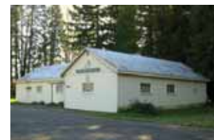
Eagle Creek #297 Clackamas County Organized 1901

Best known for: Strawberry Waffle Breakfast, Anything Goes Sale, Holiday Craft Sale, Tree Lighting, Town Hall Meetings and Candidate Forums. Other projects: Park Committee for Boring Station Trailhead Park, Adopt-the-Road, and the BBQ for Boring-Dull Day Park Social.