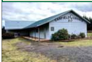
Garfield #317 Clackamas County Organized 1902

Location: 33460 SE Divers Rd., Estacada Meets: 4th Wed 8:30am Website: Garfield-Grange.com