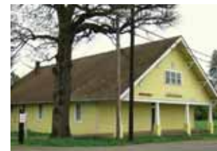
Frogpond #111 Clackamas County Organized 1873

Best known for: flea markets Other projects: Easter egg hunts and Valentine's Day Dinners