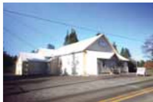
Beavercreek #276 Clackamas County Organized 1896

Best known for: venue for square dancing. Other projects: venue for vintage radio and vintage auto groups