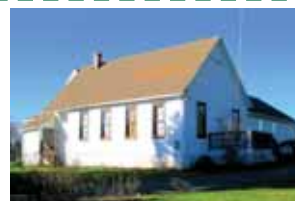
The Sandy #392 Clackamas County Organized 1909

Location: 34705 SE Kelso Rd, Sandy Meets: 2nd Sat 7:30 pm except 3rd Sat September; potluck 6:30 pm