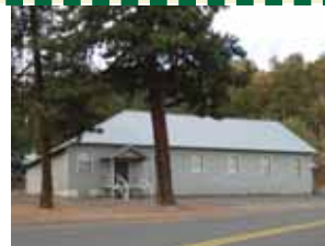
Ramsey Park #352 Wasco County Organized: 1905

Location: 81184 Dufur Valley Rd, Dufur Meets: 4th Sunday 2 pm dessert