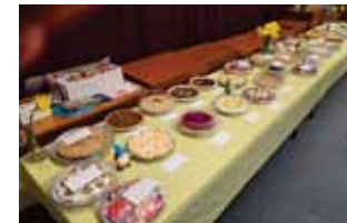
Above: The pie auction was a fun evening and raised funds toward new flooring for the Grange.

McKenzie, Mohawk, Walterville and Goshen Granges.