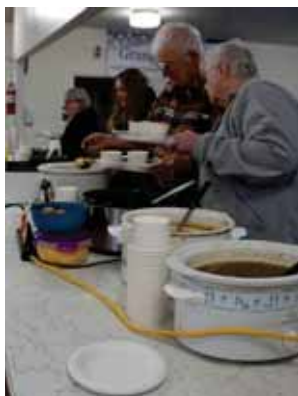
Above: Several varieties of homemade soups were offered for the tasting and enjoying.

with a total of 54 cats fixed, six females and 48 males.