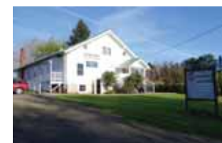
Warner #117 Clackamas County Organized 1874 (Re-org 1882)

Location: 10100 S New Era Rd, Canby Meets: 3rd Thurs 7:30 pm; potluck 6:30 pm