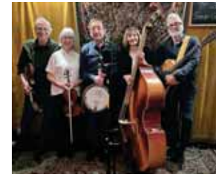
ditional bluegrass lens.