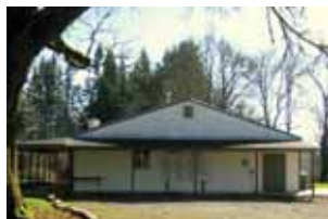
Harding #122 Clackamas County Organized 1874 (Re-org 1886)

Best known for: Feeding the community. 1 st Saturdays Breakfast, St. Patrick's, Day Dinner Mother's Day Breakfast, Christmas Dinner and Tree Lighting. Uniqueness: partnership with Scouts, Lions, Welch Church, and Hamlet of Beavercreek