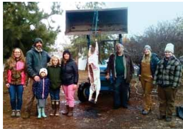
Below: attendees of the lamb slaughtering class with their butchered lamb. The Grange holds several classes a year and many are free and open to all county residents; all ages are encouraged to attend.