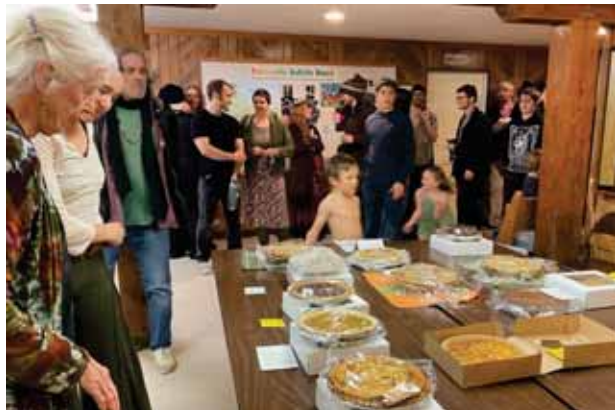
Above: Members of the crowd look over the pies.