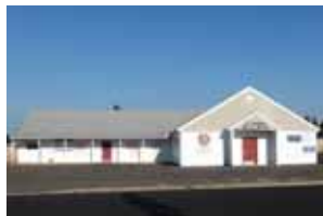
Molalla #310 Clackamas County Organized 1874

Other projects: community dance; thank you party for renters