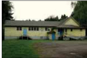
Milwaukie #268 Clackamas County Organized 1894

Other projects: Wild Hog Dinner & Dance; Christmas field trip, donations to school & homeless causes. Use by Boy Scouts & team dancing