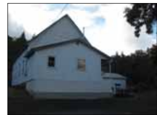
Mosier #234 Wasco County Organized 1889

Community offerings: facilities offered for monthly spay/neuter clinic; as a location for the fire service work keeping the area vegetation fire safe; coffee hours; community potlucks.