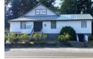
Redland #796 Clackamas County Organized 1931

Salad Bar tickets can be purchased on-site.