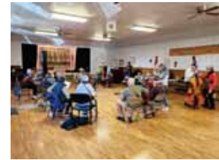
Above: The Old Time Fiddlers meet at Santa Clara Grange on the 2 nd Saturday of the month.

Membership has grown and it seems there are more people interested in joining our Grange. New