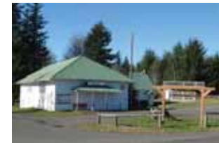
Springwater #263 Clackamas County Organized 1893

Projects: classes, road clean-ups, farmers market, donations to Redland School