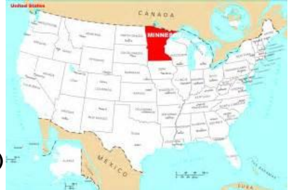
Minnesota On the Map