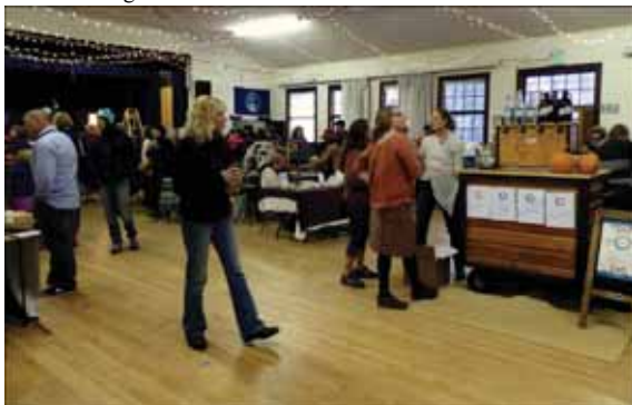
Shoppers found lots to stock their pantries for winter at Rockford Grange.

Their annual Very Berry Pancake Breakfast is a popular fund-raising event - staffed with eager volunteers and relies exclusively on the generosity of the attendees served, as only donations are accepted for the meal. They look forward to serving all the smiling faces again next year. Who knows, there might even be a pancake eating contest for those who like "seconds".