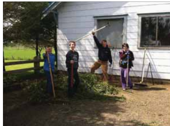
Several young people of the local 4-H group, the Double "S" Herders, who meet in the Fairview Grange hall, spent an afternoon clearing weeds in the Grange parking lot.