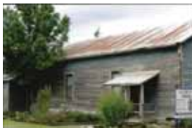
Front before & after

They pressure washed and scraped the building in preparation for painting. Then primed and painted both the siding and the trim. They