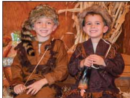
L - These two boys look like they stepped right out of the western frontier.