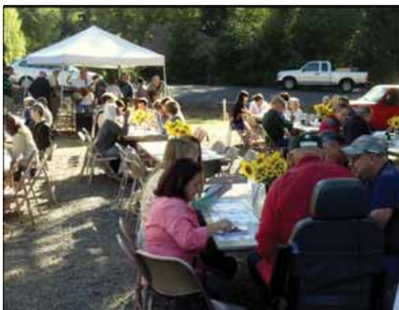
Grangers and guests enjoyed Very Berry Pancakes and music by the Old Time Fiddlers.