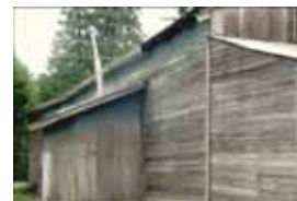
Back before & after