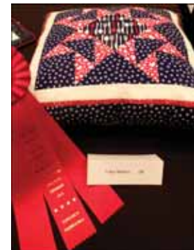
Tracy Waters' 2nd place pillow.