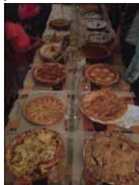
Pies, pies, pies!!! Twenty-seven unique and delicious pies were submitted for the Columbia Grange #267 Pie Baking Contest and dance.

Columbia Grange #267 plans to hold its "Second Annual Pie Baking Contest" in 2016—it was all so tasty, and too much fun to pass up next year!