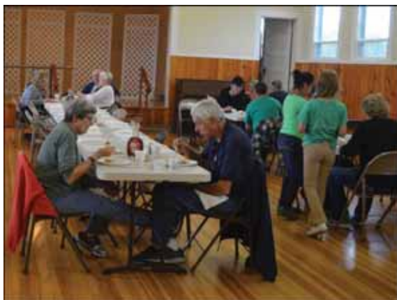
The large crowd attending the benefit breakfast for UCC kept the young people busy serving.