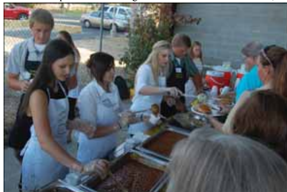
South Wasco County High school students and graduates serving dinner

The dozen students who volunteered their time are an example of the caliber of scholarship applicants that the Grange sees each year. For the 2015-2016 academic year, $22,000 in scholarships were awarded. The Grange expects to be able to award a similar amount for 2016-2017 year.