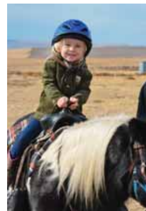
A young party goer enjoys a pony ride.

The Lexington Grange hosted its second annual Pumpkin Picking Party Sunday October 25th. Events at the Pumpkin Party included pumpkin decorating, pony rides, pumpkin bowling, haystack diving,