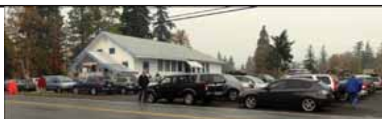
Rockford Grange members were thrilled with the turnout.