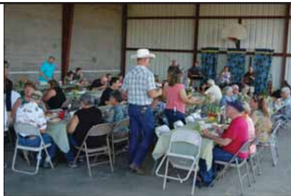
Community members enjoying dinner and music by CinderBlue