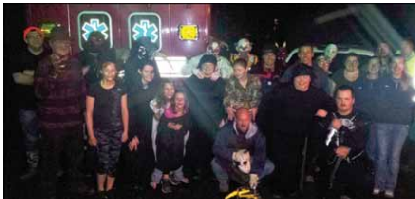
Morning Star's Haunted House Crew for 2015. They sure scared a lot of people!