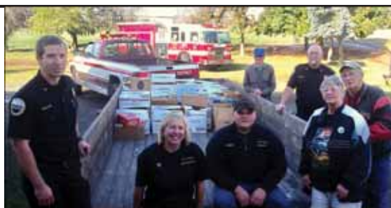
Here's part of the crew with 3100 pounds of food for the Jefferson Fire Department Christmas Food Basket Program.