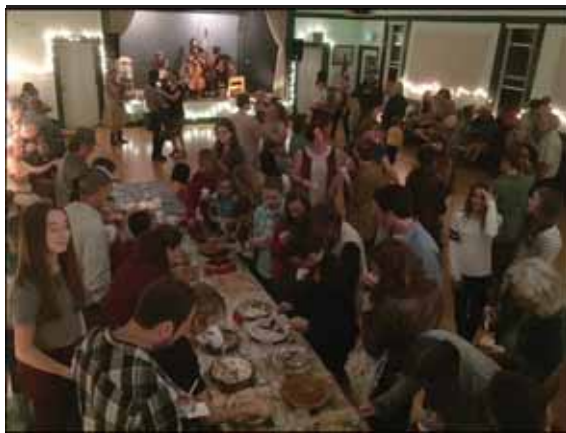
More than eighty people danced the night away and tasted 27 different pies at Columbia Grange #267 "Pie Baking Contest & Dance."