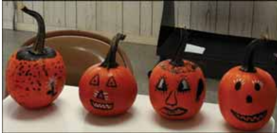
Four painted pumpkins waiting to be shared.