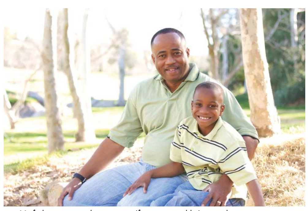
My father gave me the greatest gift anyone could give another person, he believed in me.