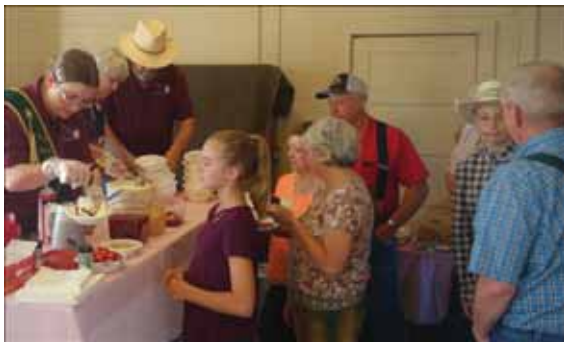
Ice cream social at North End Grange.

I also want to give a shout out to the good people at North End Grange in Wallowa County. They won the ice cream social for District #6 in the GrangeUp program. Mom and Dad, with a bunch of G.R.O.W. club members went over to serve ice cream, and of course Mom brought me back a new toy and some snacks. I love Grange!