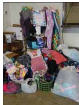
1061 items were collected for the "Keeping Oregon Warm" project. Thank you Grangers.