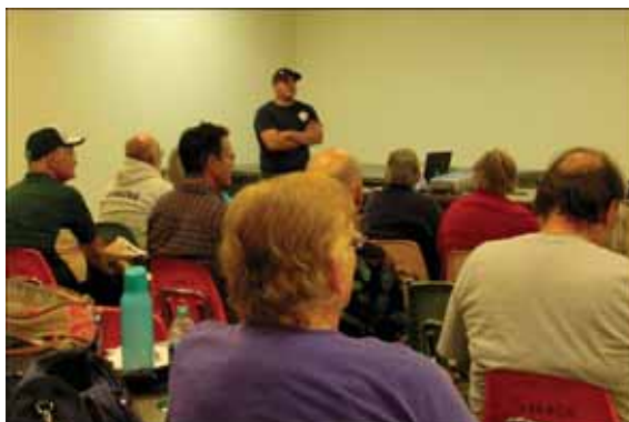
Twenty-Five members of the Dorena Grange community attended the FireWise presentation.

Twenty-Five members of the community attended. Refreshments were served after the presentation.