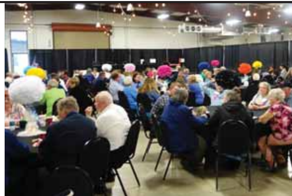
Monday evening's Grange Connects Pep Rally and celebration of a successful GrangeUp '17 program to pep up the crowd to push forward for another successful year.