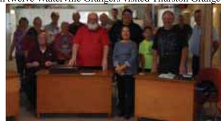
Above: Waltherville visited Thurston Grange.

Thurston was very friendly and welcoming. They both shared about events and ideas and ended with more delicious desserts.