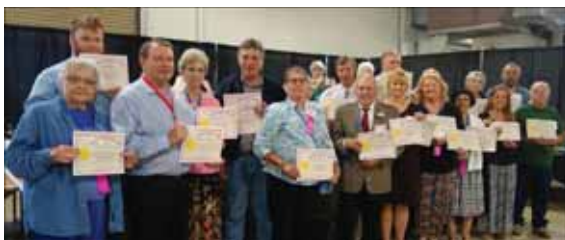
Granges received their certificates for 15% or more gain in membership at the Membership Luncheon during State Grange convention.