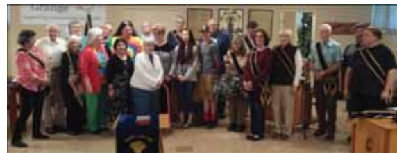
Above: Waltherville visited London Grange.

In closing, know that "Your mind is a powerful thing. When you fill it with positive thought, your life will start to change".