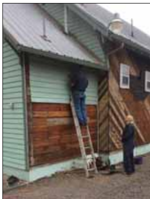
Above: the old bubbling siding was removed from the Grange hall and replaced with Hardiplank siding. Below: what a difference it makes.

While saving money for the project on the five year plan the Grange put in a couple of grant applications and scored in 2018. With the materials funded, work crews were signed up and organized for a late spring project. Farm chores interfered a bit however, and the project actually went to construction in early July. They were worried about the heat, until it started raining on them. After things dried out the project went smoothly and was substantially complete in about a week. Still some detail work to do on windows that got refinished at the same time but the siding is great!