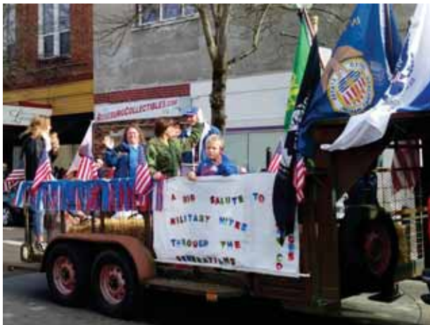
A salute to generations of military wives and family members was included on the Douglas County Pomona Grange float.

This year's Grand Marshals were representatives from generations of military families representing the parade's theme "Celebrating Multi-Generational Military Families."