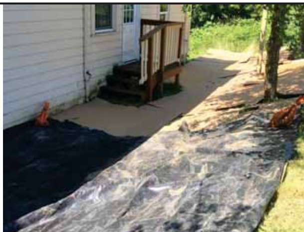
The area for the hedgerow was prepared in early summer by members of Columbia Grange.