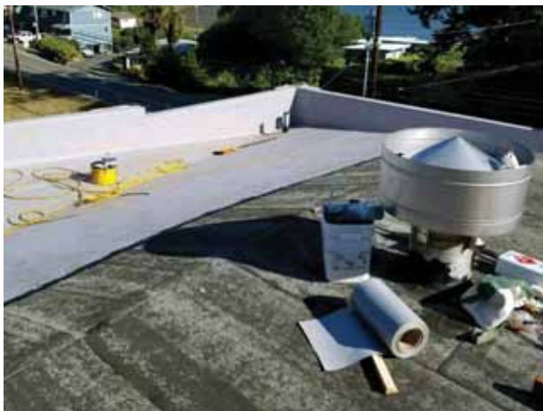
Above: The reroofing of North Bayside Grange allowed TPO from the barrel section to tie into that of the drainage area, providing a secure seal that should hold for years to come.