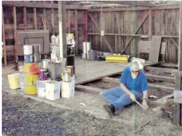
Left: Pulling nails was one of the many projects involved in taking down the old shed.