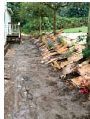
Above: Once the fall rains arrived members got busy planting the selected plants. The bees should be happy with their new food source.