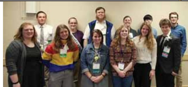
Twelve Youth and Young Adults from around the country competed in Grange Baseball at the National Convention.