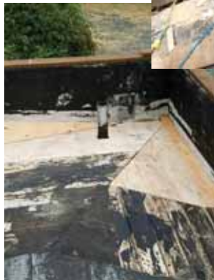
Left: the roof already for the TPO.