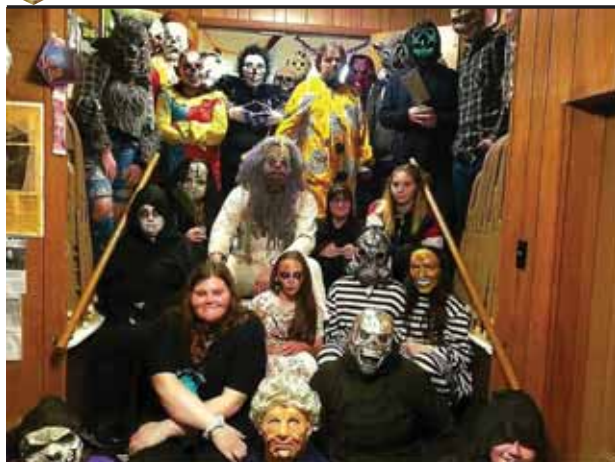
The cast of the haunted house in masks and makeup. Most of the volunteer cast and crew are not Grange members but without them there would be no haunted house.