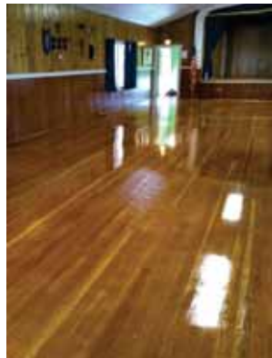
Above: beautiful, shiny floors were the final outcome.

The project required the removal of the old finish that was remaining on the floor and applying a new multi-coat finish to protect the wood floors from continued wear and potential food and drink stains. Unfortunately, the first application of the multi-coat finish did not set up correctly and had to be removed and reapplied. The second application worked as expected. The company that did the original work stood behind their work and re-sanded the