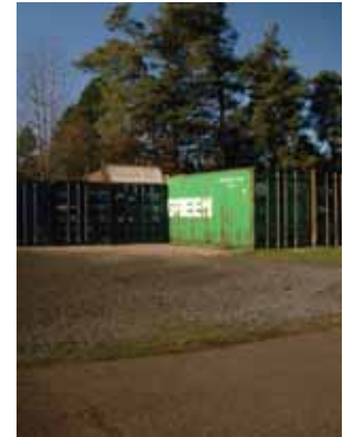
Above: five storage containers now provide dry, rodent free storage for Beavercreek Grange, the nonprofits that use their hall and Clackamas County Pomona Grange.

Beavercreek Grange wants to say thanks to everyone that helped with all aspects of this project.