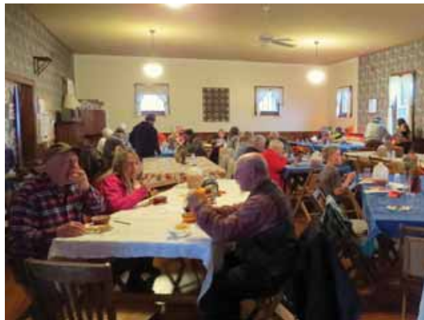
Chili and cornbread were enjoyed by the community at Pleasant Grove Grange.

Money raised from the pie auction is used for maintenance and improvements of the Grange hall. Their current project is to re-wire a portion of the building.