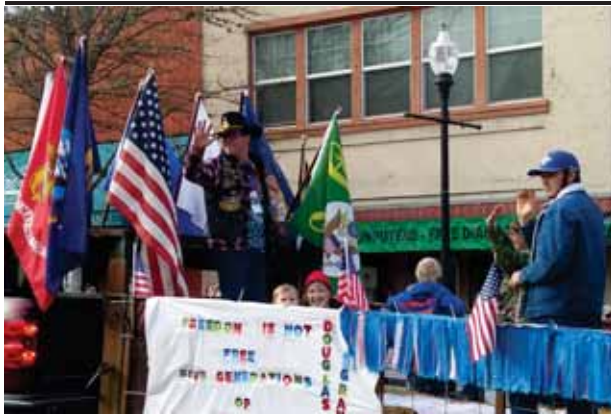
Freedom is not free was one of the themes expressed on the Douglas County Pomona Grange float.