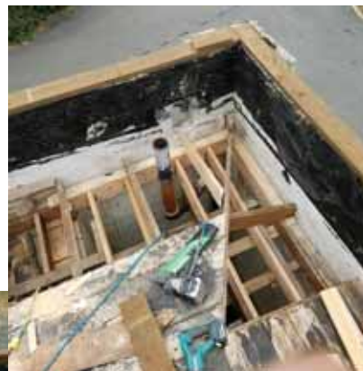
Above: the damage to the roof was more than the Grangers expected and took a lot of rebuilding.

The Grange could not have finished the roof without the assistance of grant funds from the State Grange. With that, they would like to thank Susan Noah, Master of the Oregon State Grange, for forming the grant program. Not only have North Bayside benefitted tremendously from this program, but other Granges have benefitted as well.