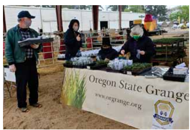
Above: Grangers ready the potted marigolds for distribution; wrapping an information and growing instruction hand out around the pot then slipping them into plastic bags for safe handling.

For more information on the market, email them at redlandgrange-FM@gmail.com