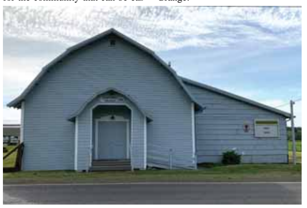
Sandlake Grange has a new reader board thanks in part to the Oregon State Grange Sign Reimbursement program.

Recently the Grange applied for a Community Giving Grant from the Tillamook People's Utility District to pay for an electrical upgrade to bring the building up to code after a recent inspection by the State Fire Marshall. They are very appreciative of being awarded $1,600 for this project. Members will be continuing with the efforts for the preservation of the hall and of Sandlake Grange.