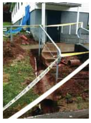
wet, cold, dirty job.

After looking the situation over, members Joe. Coralvnn Condon, and Dale Schultes decided the only course of action was to replace the drainage pipe. As you can see in the picture that it was no easy solution. Reminder this happened in late December and the weather was not exactly warm. Thus a dirty job became a